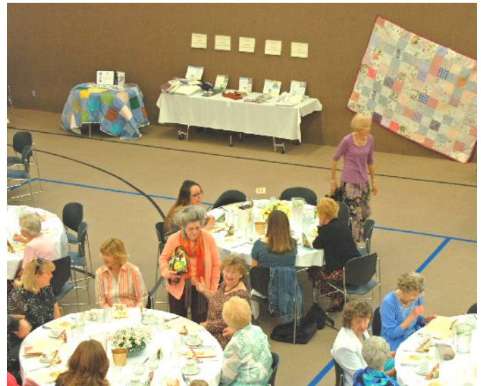
There were all ages in attendance.