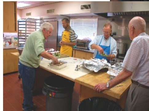
Thank you to the men, our servers.