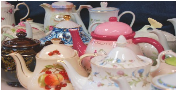
Ladies bring their own teapots to share for this special day